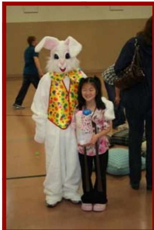
2010 Easter Egg Hunt with a visit from the Easter Bunny.