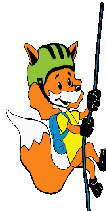
Sparx the 2009 VBS Mascot